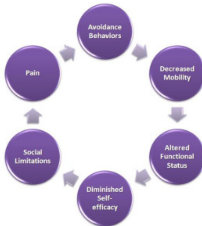
Figure 1. The Vicious Cycle of Pain.

The prevalence of persistent, debilitating pain is increasing, commensurate with advances in trauma care that allow survival after serious injury and medical care that slow disease progression, or transform imminently life-threatening diseases into chronic progressive conditions, or provide a cure but with residual morbidity. Similarly, the growing proportion of older individuals in economically developed and developing nations, and the propensity to develop chronic pain-producing conditions with