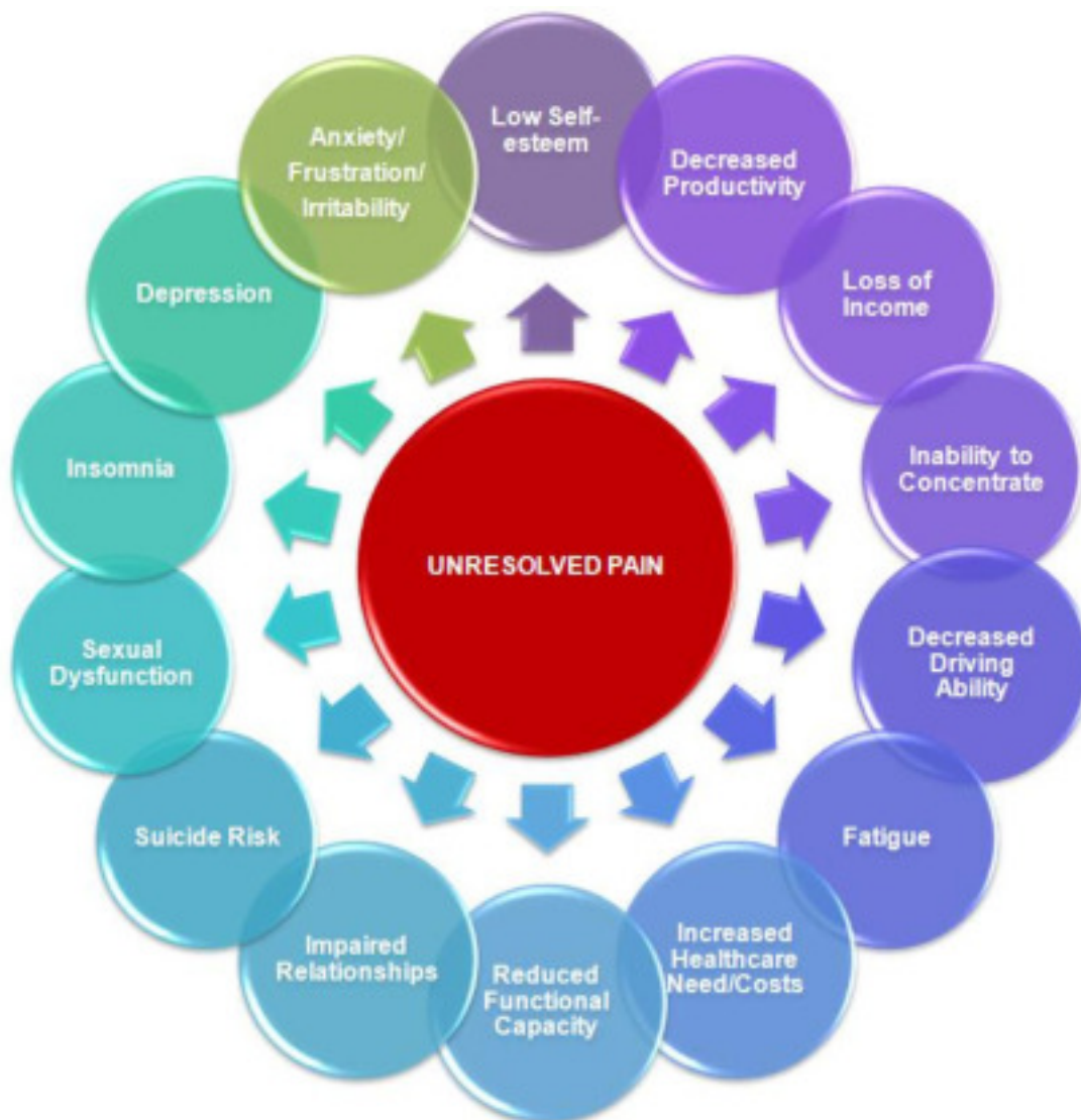
Figure 2. Consequences of Unresolved Pain.

The first portion of this article presents a very basic review of the pharmacology of the cannabinoids and endocannabinoid receptor system, drawing both from animal and human models. 6 Although cannabinoids have putative therapeutic